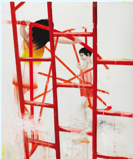
Bertrand Peret - Playing with To Nhi, 2010