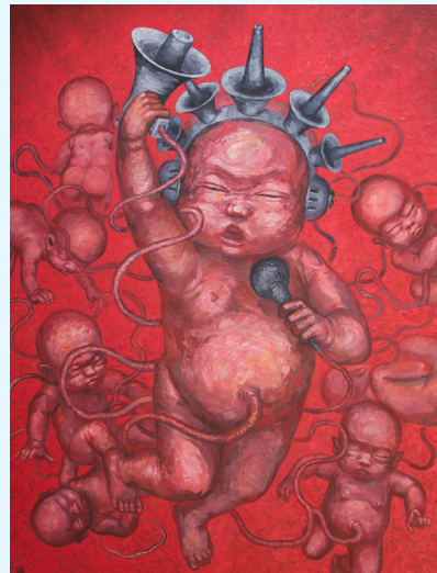
Pham Huy Thong - Liberty, 2009